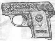
Mechanism of the ASTRA Pistol, Mod. 200